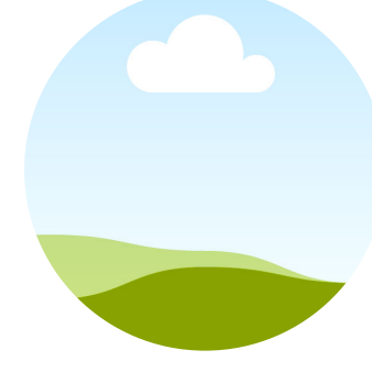
Komal | Mentee